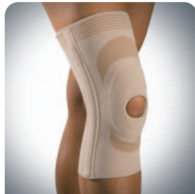
BORT Knee Bandage with Patella Recess